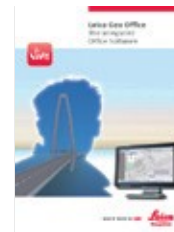
Leica Viva LGO Product brochure