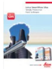
Leica SmartWorx Viva Product brochure