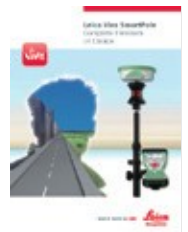
Leica Viva SmartPole Product brochure