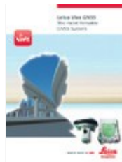
Leica Viva GNSS Product brochure