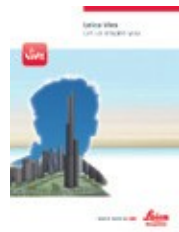
Leica Viva Overview brochure

Illustrations, descriptions and technical data are not binding. All rights reserved. Printed in Switzerland – Copyright Leica Geosystems AG, Heerbrugg, Switzerland, 2012. 774162en – 01.14 – galledia