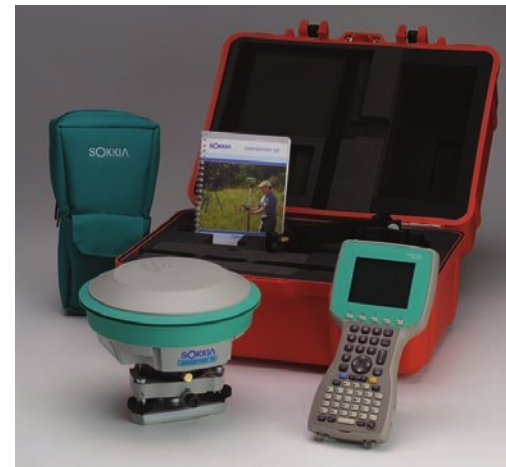
(Tribrach and tribrach adapter included with base kit only.)