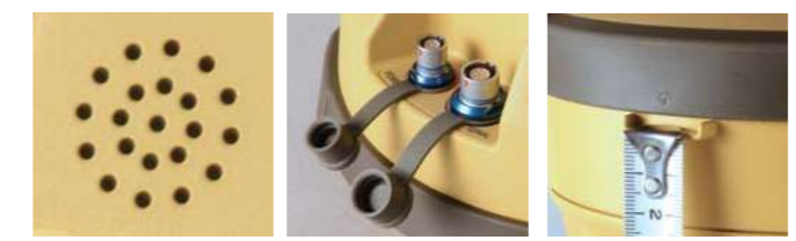
Speaker External power port Serial port Tape measure hook