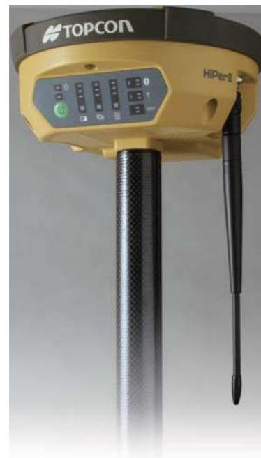
HiPer II The Next Generation Dual-Frequency GNSS Receiver

The HiPer II receiver is designed on these clear-cut concepts. This state-of-the-art receiver not only offers further enhanced agility, but also increases receiver performance and user-friendliness as well as the fully customizable structure providing our customers with the maximum flexibility to choose the system options they require.