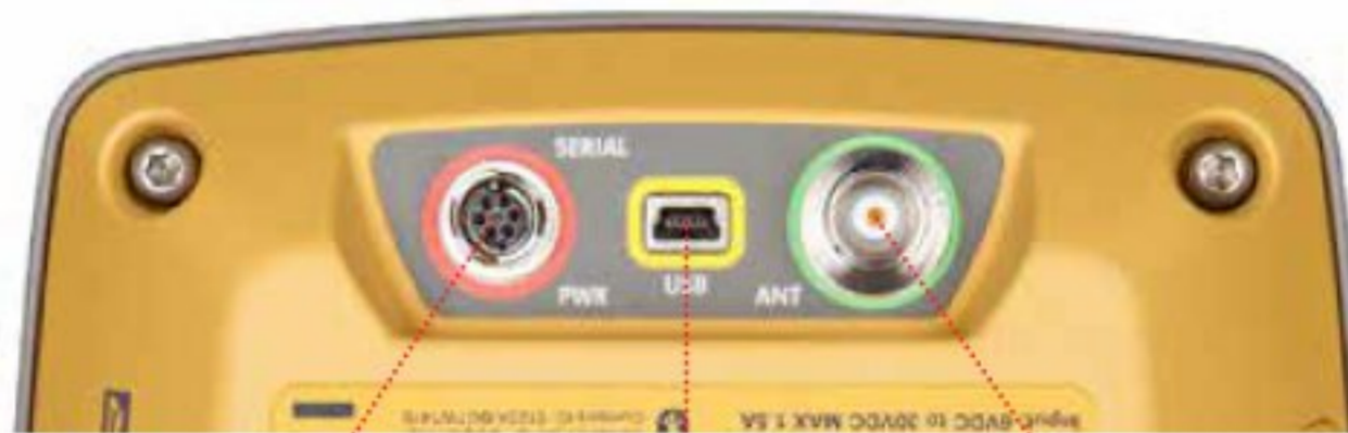
Waterproof Communication and Charging Port